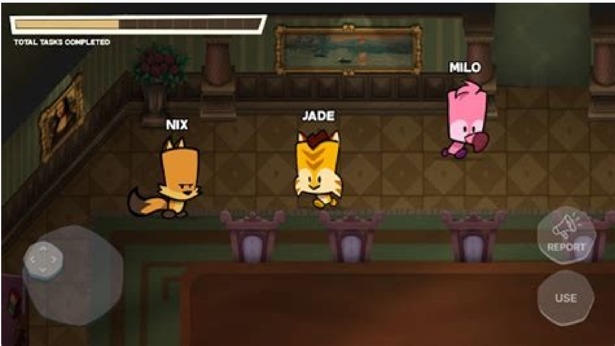
Zooba suspects mystery mansion download pc.