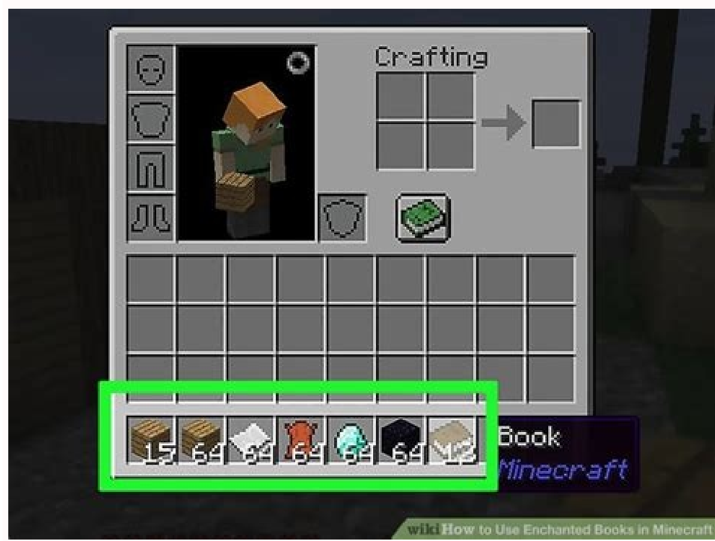
wiki How to Use Enchanted Books in Minecraft