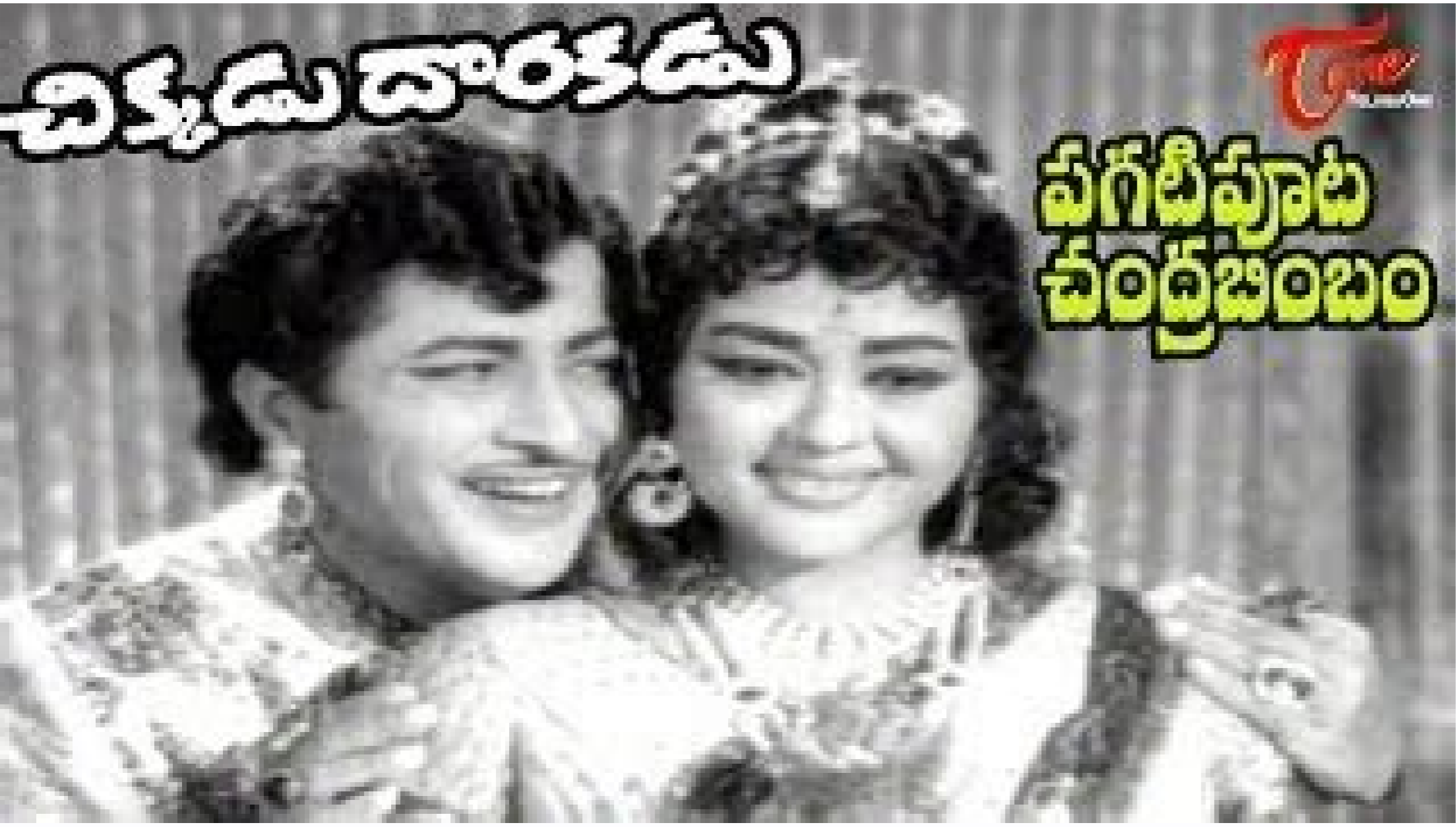
Atma balam telugu movie songs download. Atma balam old telugu movie mp3 songs free download.