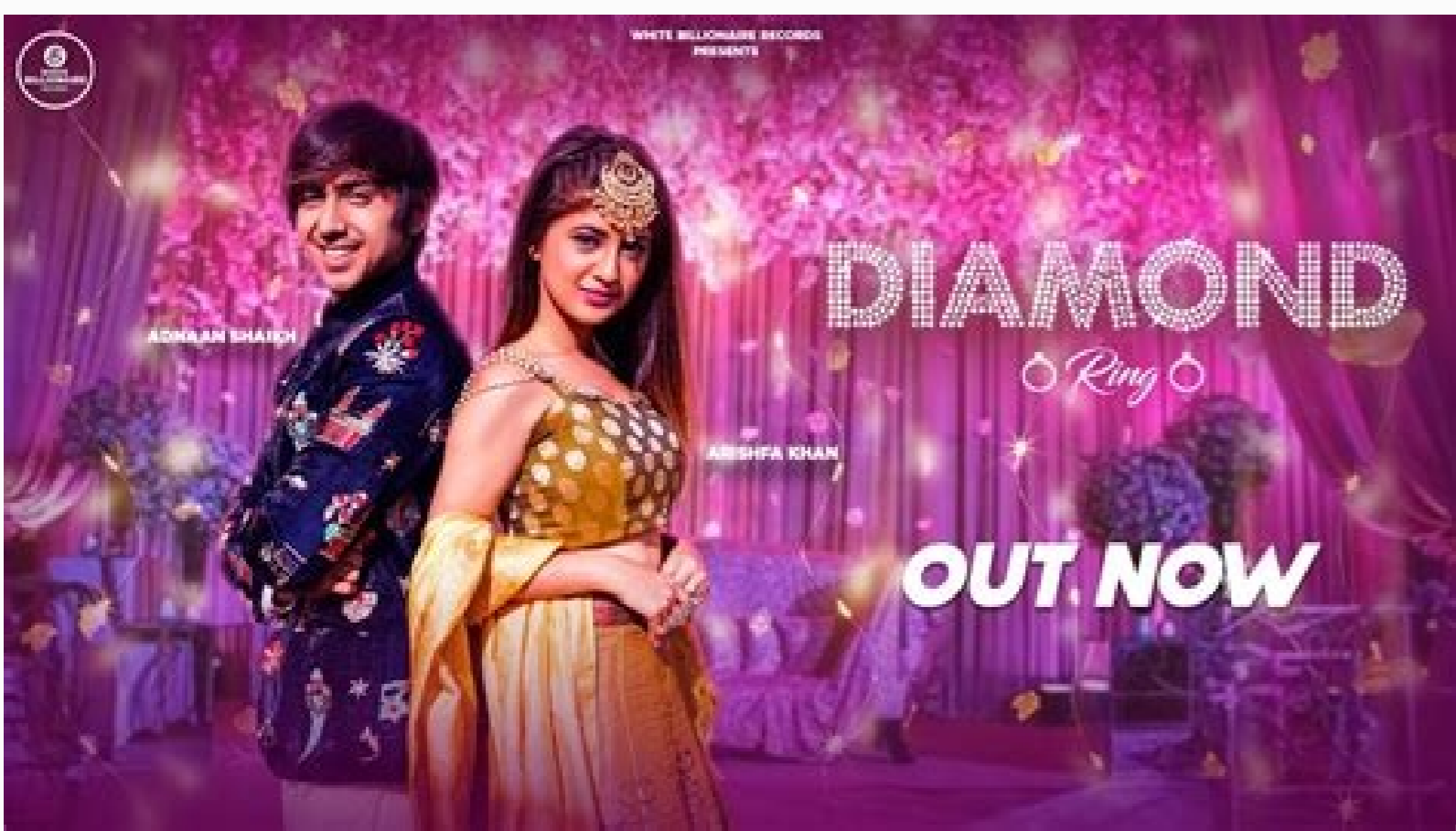
Yaara arishfa khan song download mp4.