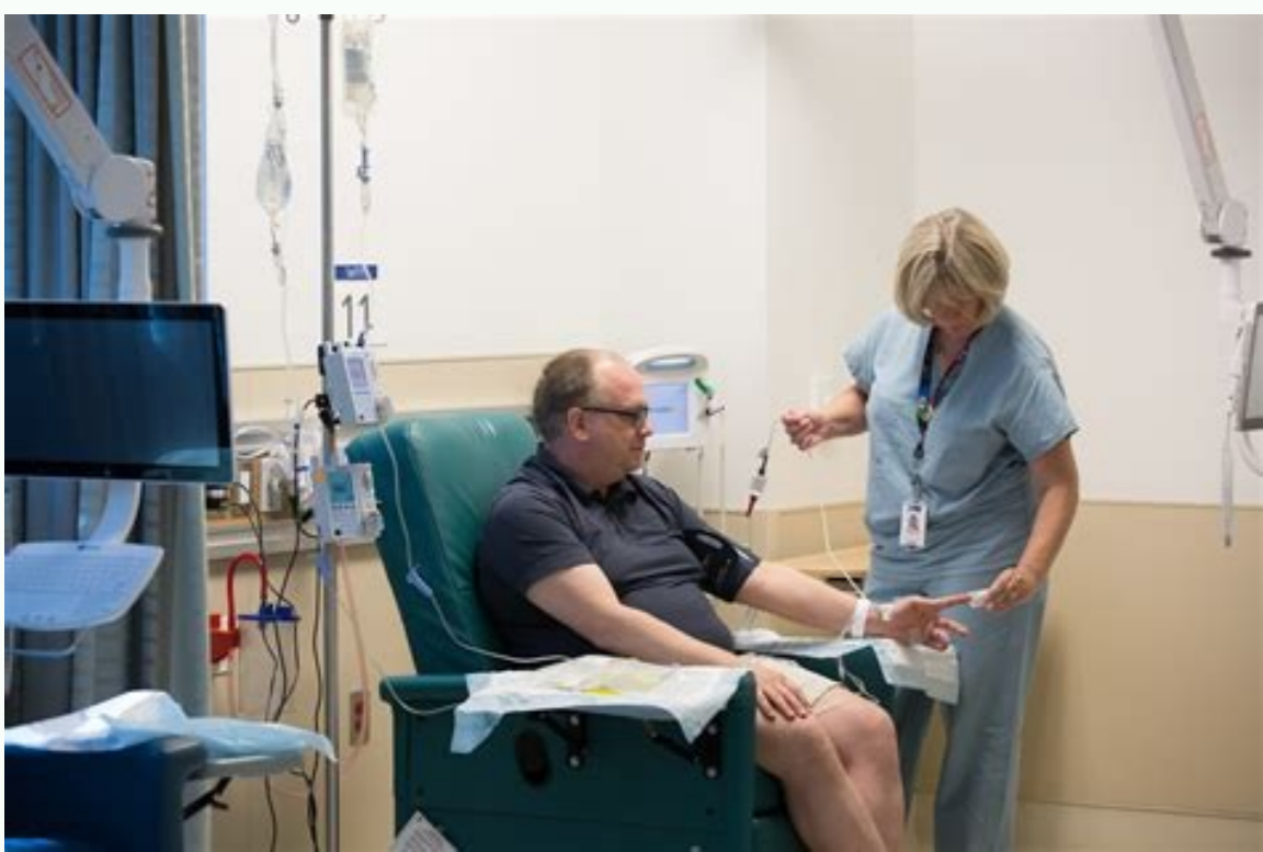
Hospital foundation annual report. Humber river hospital annual report.