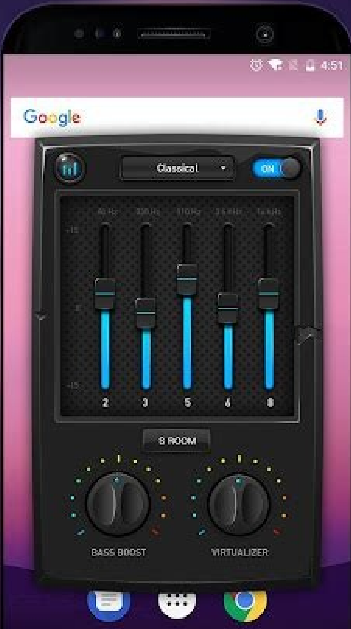
Music equalizer and bass booster for android. Download bass booster equalizer for android. Download bass booster equalizer for android apk. Best bass booster equalizer for android. Bass boost best equalizer settings for bass android.