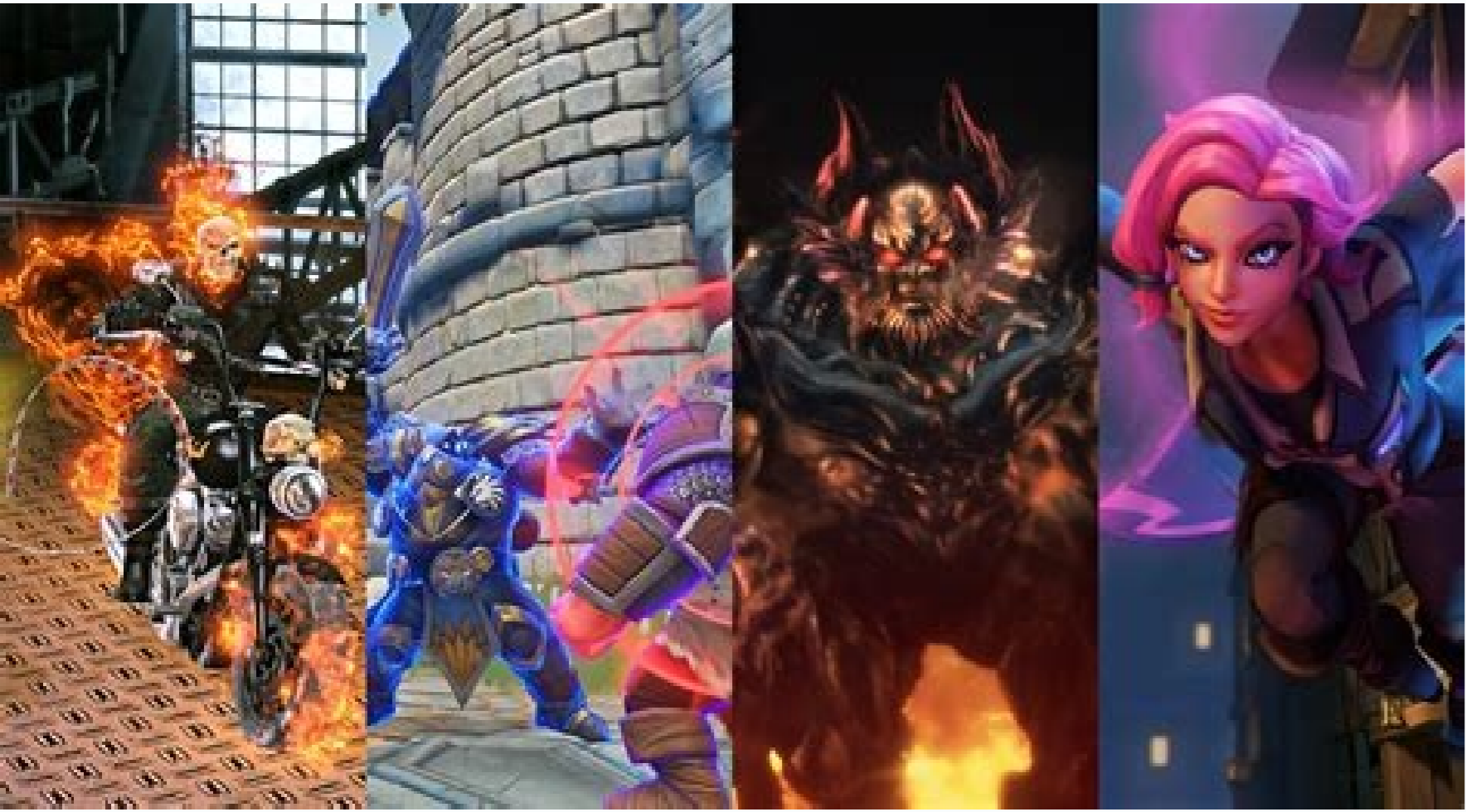
Top grossing games google play. What is the top grossing mobile game. Top 1 grossing game in play store. Top 10 grossing games in play store. Highest grossing app game.