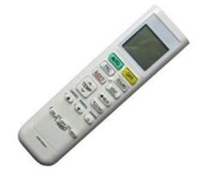
Carrier aircon instruction manual.