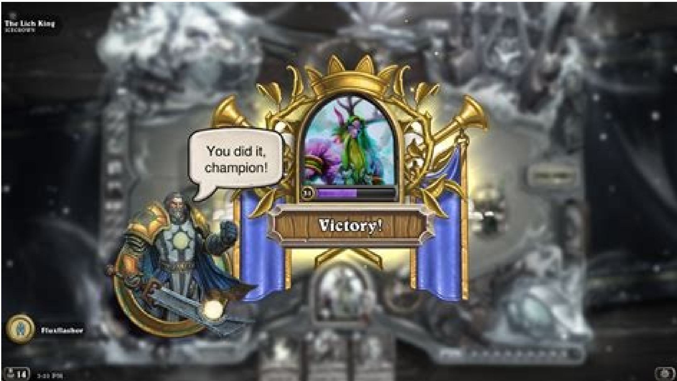
Icecrown citadel solo guide. Icecrown citadel solo.